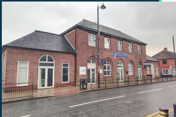
St Luke Terrace Sunderland SR4