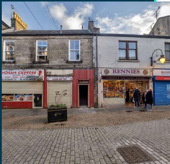
Main Street Kilsyth G65