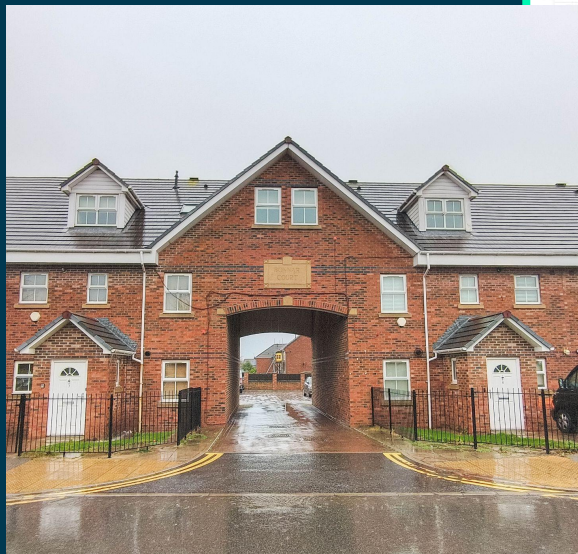
Bonnar Court, Hebburn, NE31