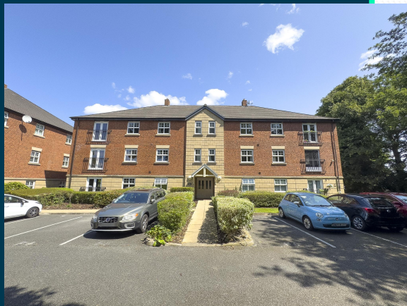
Chapel View, Wirral, CH62