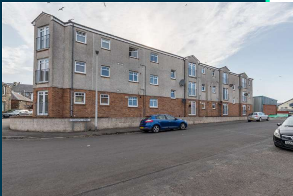
Meldrum Court, Kirkcaldy, KY2