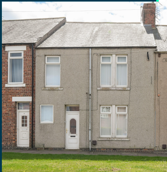
Ridge Terrace, Bedlington, NE22