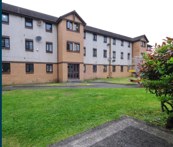
Valley Court, Hamilton, ML3