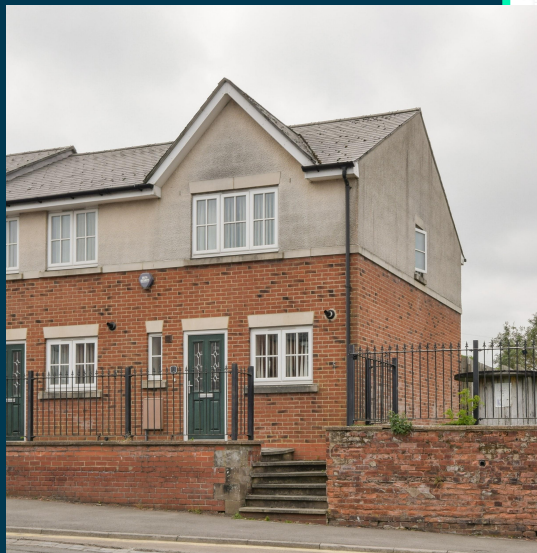
Chapel Place, DL14