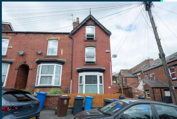
The Nook, Sheffield, S10