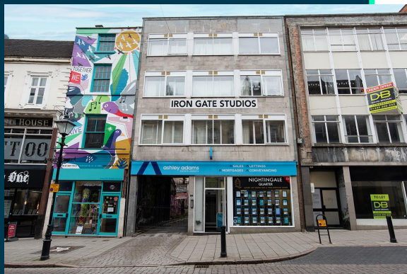
Iron Gate Studios, 37-38 Iron Gate, Derby, DE1