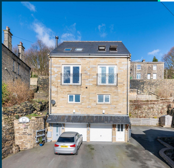
Longwood Gate, Huddersfield, HD3