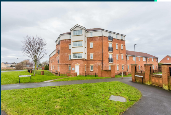
Stamfordham Court, Ashington, NE63 8TH