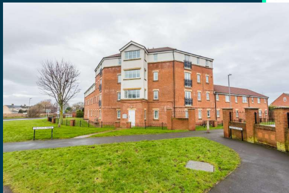
Stamfordham Court, Ashington, NE63 8TH