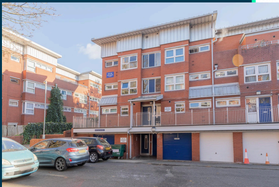
Moss House Close Birmingham B15 1HE