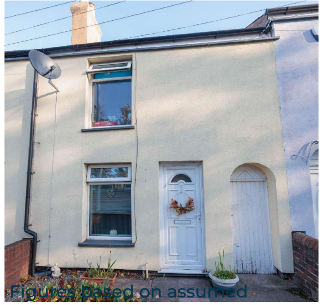
purchase price of £115,000.00 and borrowing of £86,250.00 at 75% Loan To Value (LTV) and an estimated 5% fixed term interest rate.