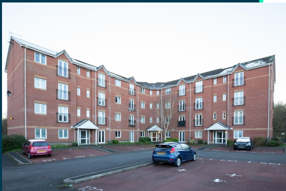
Waterside Gardens Bolton BL1 8WB