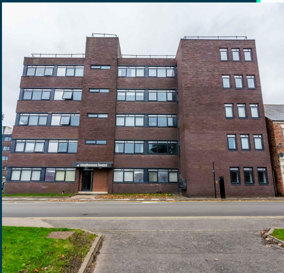
Stephenson House, Stephenson Street, North Shields, NE30 1QA