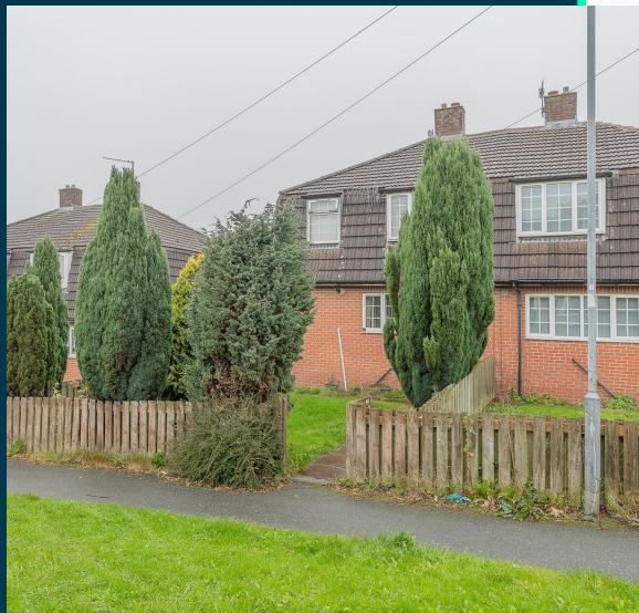
Yew Place, Newcastle ST5 7BQ