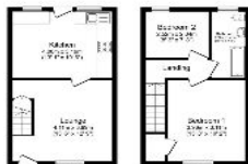
Ground Floor First Floor