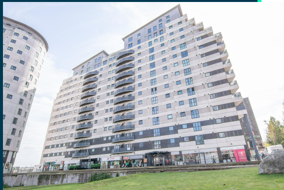
MassHouse Plaza, Birmingham, B5 5JF