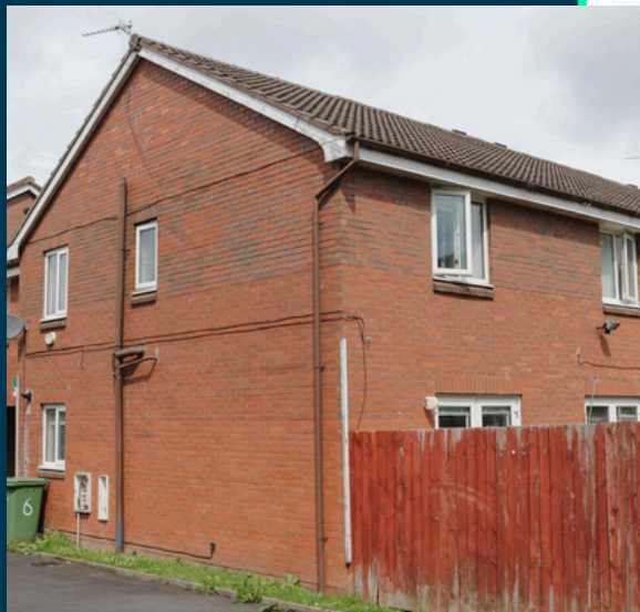
The Strand, Sunderland, SR3