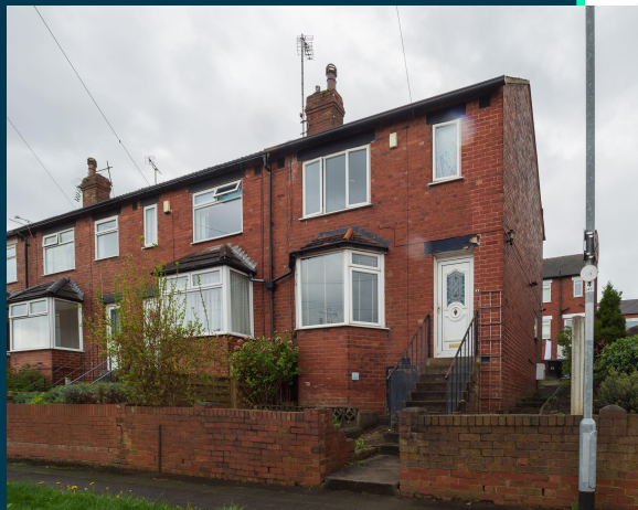
Aston Place LS13 2DH