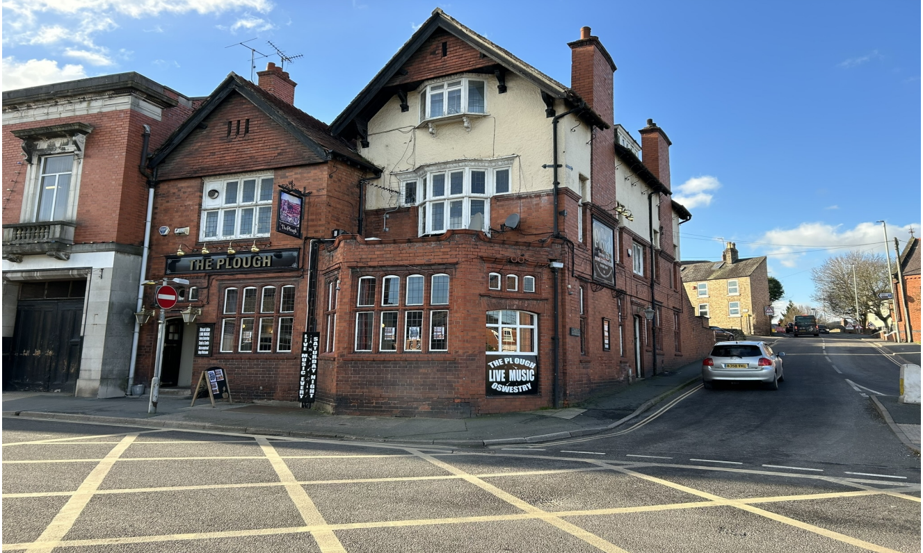
The Plough, Beatrice Street, Oswestry, Shropshire, SY11 1QE

Freehold Town Centre Pub with Development Potential - £249,950.