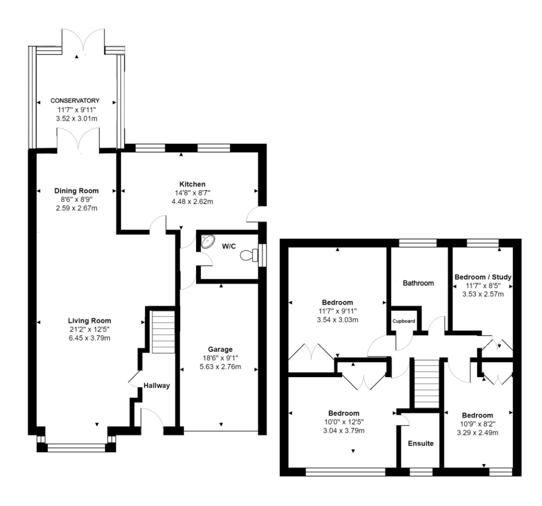
Total Area: 1436 ft<sup>2</sup> ... 133.4 m<sup>2</sup>