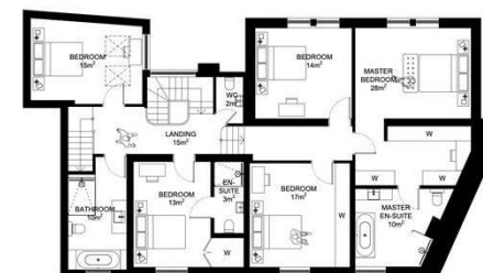
FIRST FLOOR: 167m 2