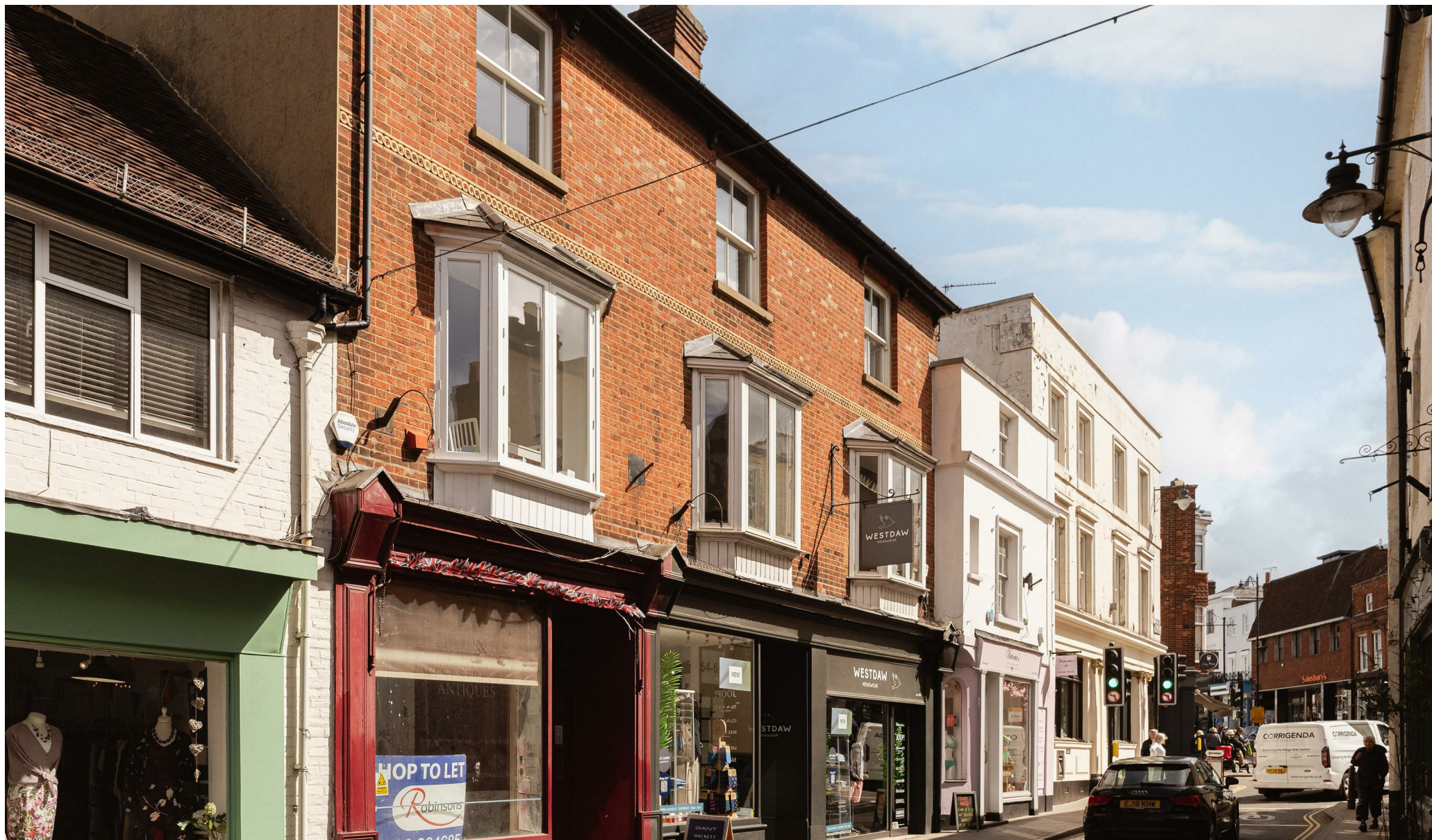
West Street, Dorking £385,000