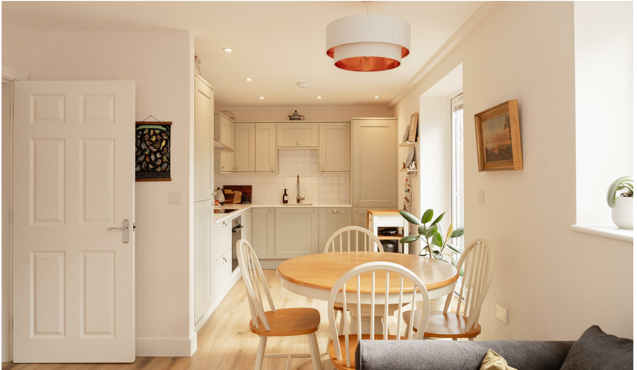
Chalkpit Lane, Dorking £350,000