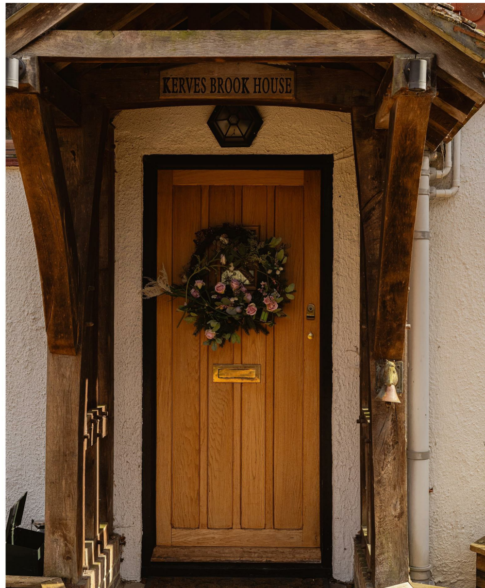
Kerves Lane, Horsham £3,000,000