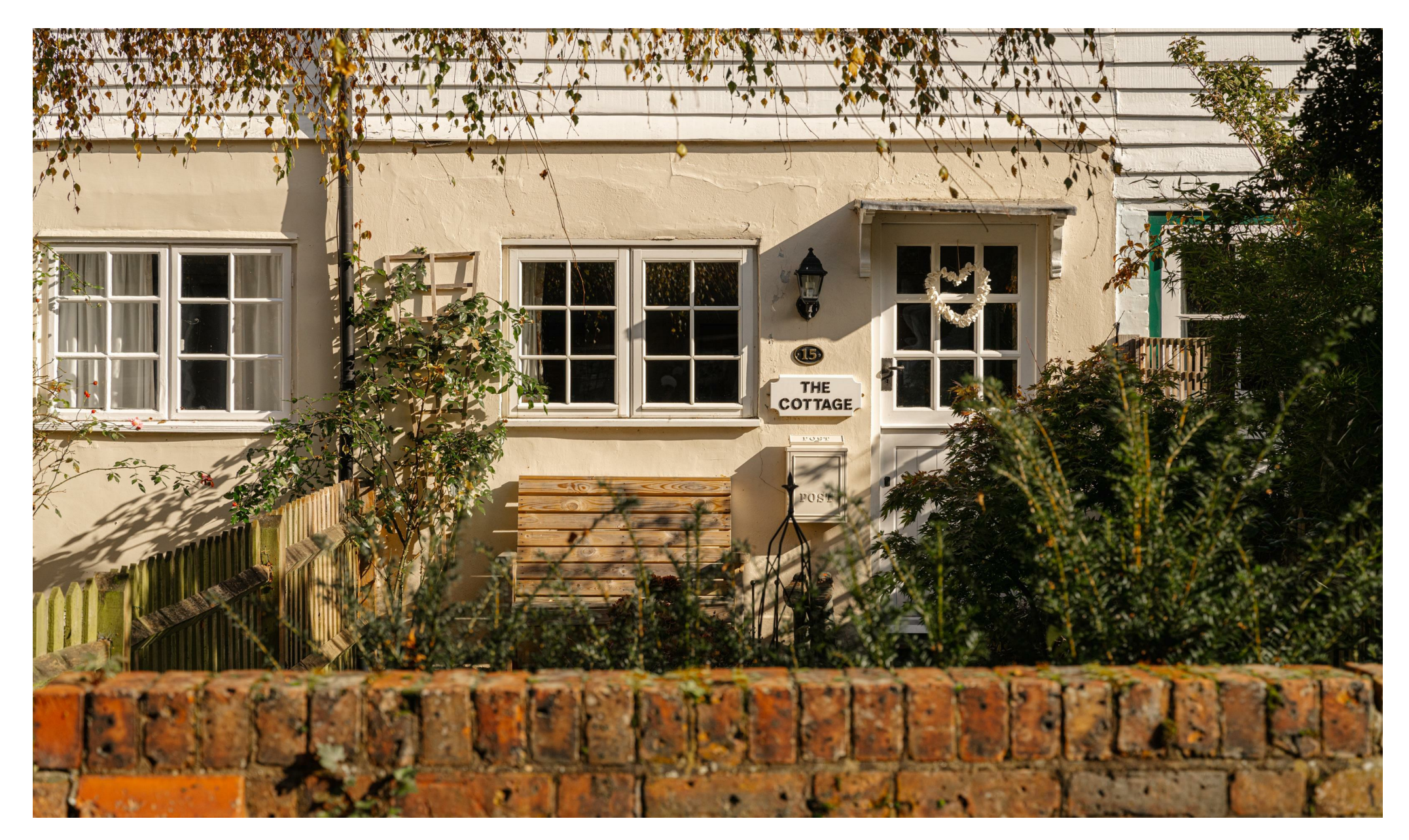
North Street, Dorking £350,000