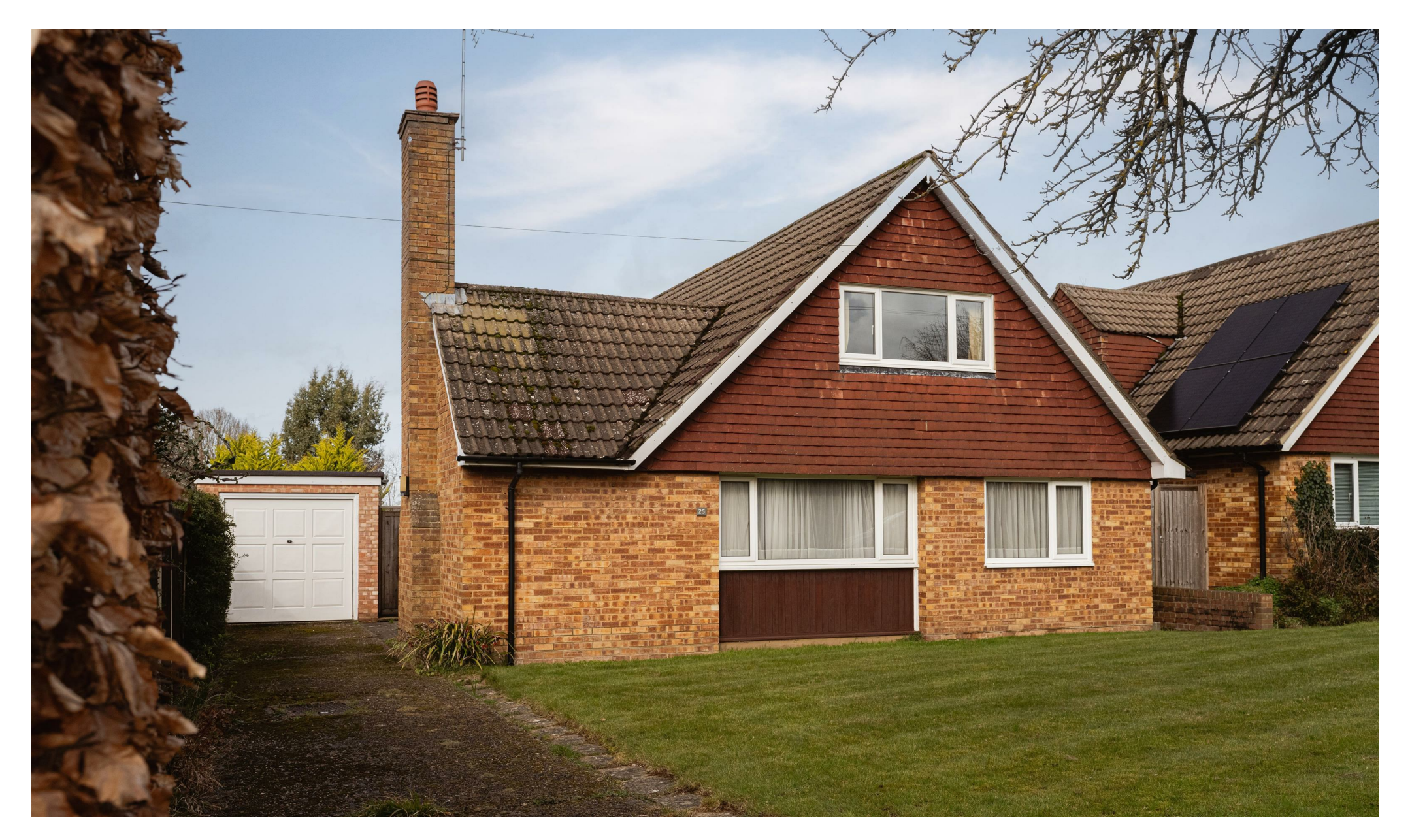
Barn Meadow Lane, Leatherhead £625,000