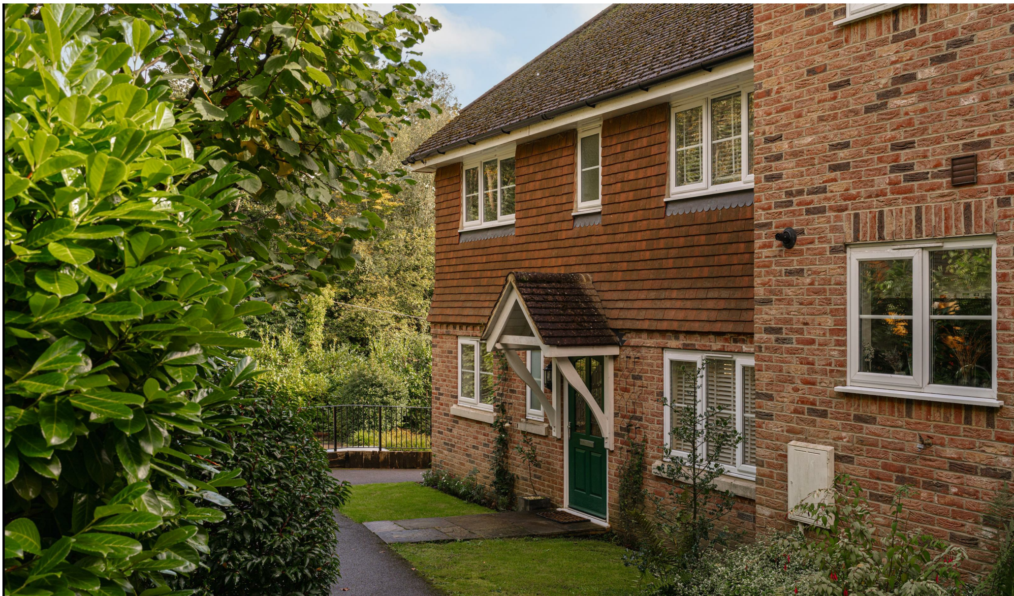
Chart Lane South, Dorking