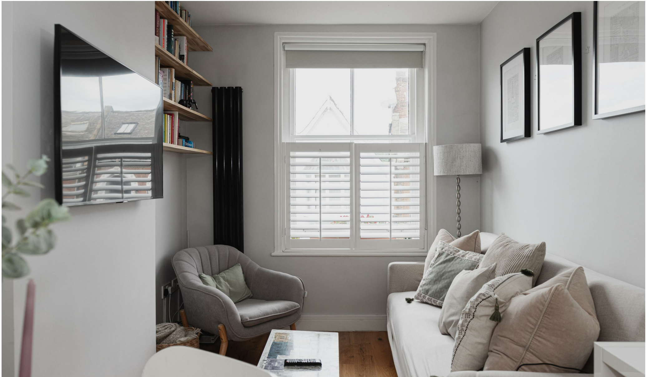
Paper Mews, Dorking £215,000