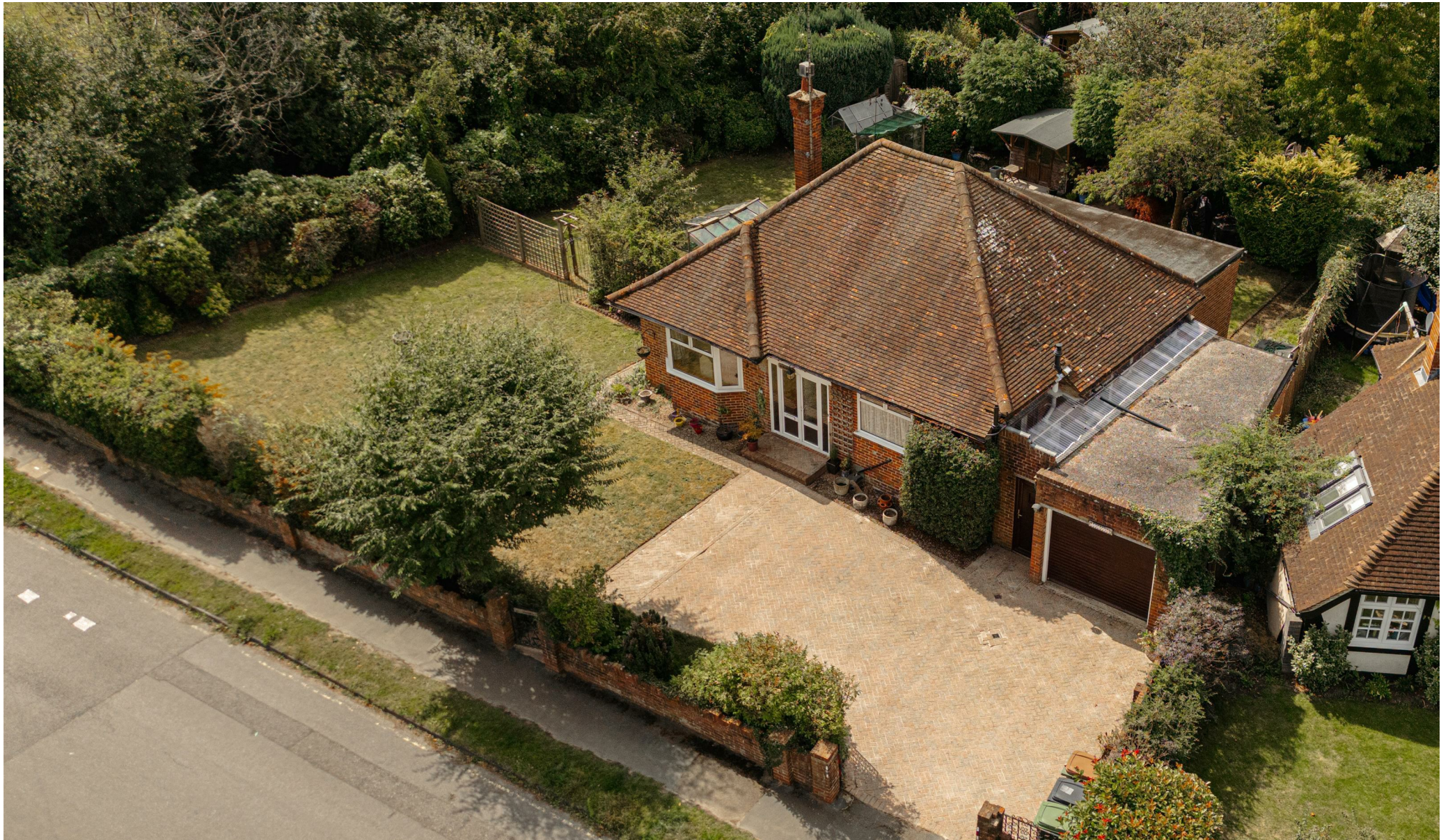
Longfield Road, Dorking £800,000