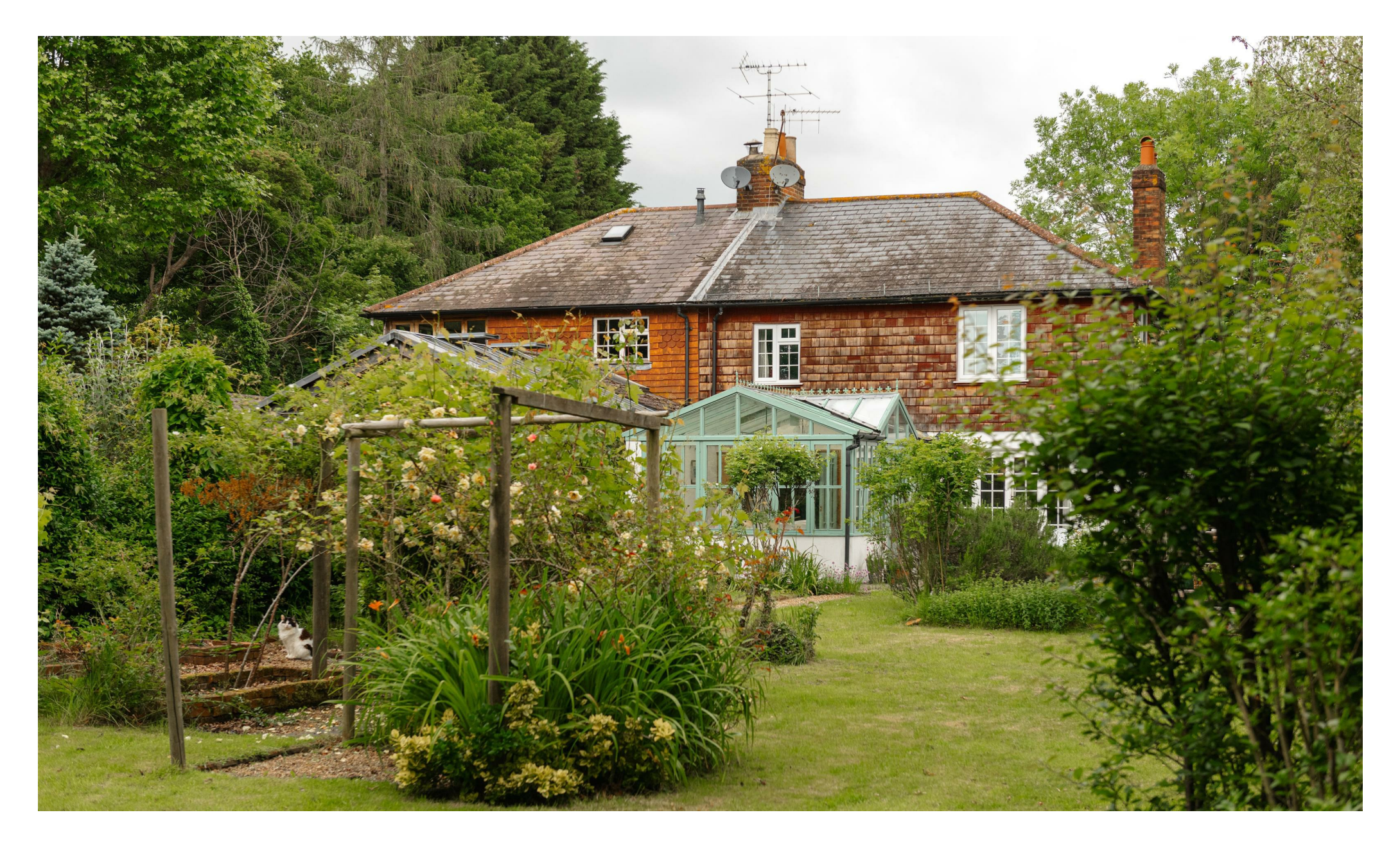
Effingham Common, Leatherhead