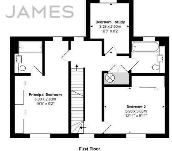
The Penshurst, The Green, Ewhurst