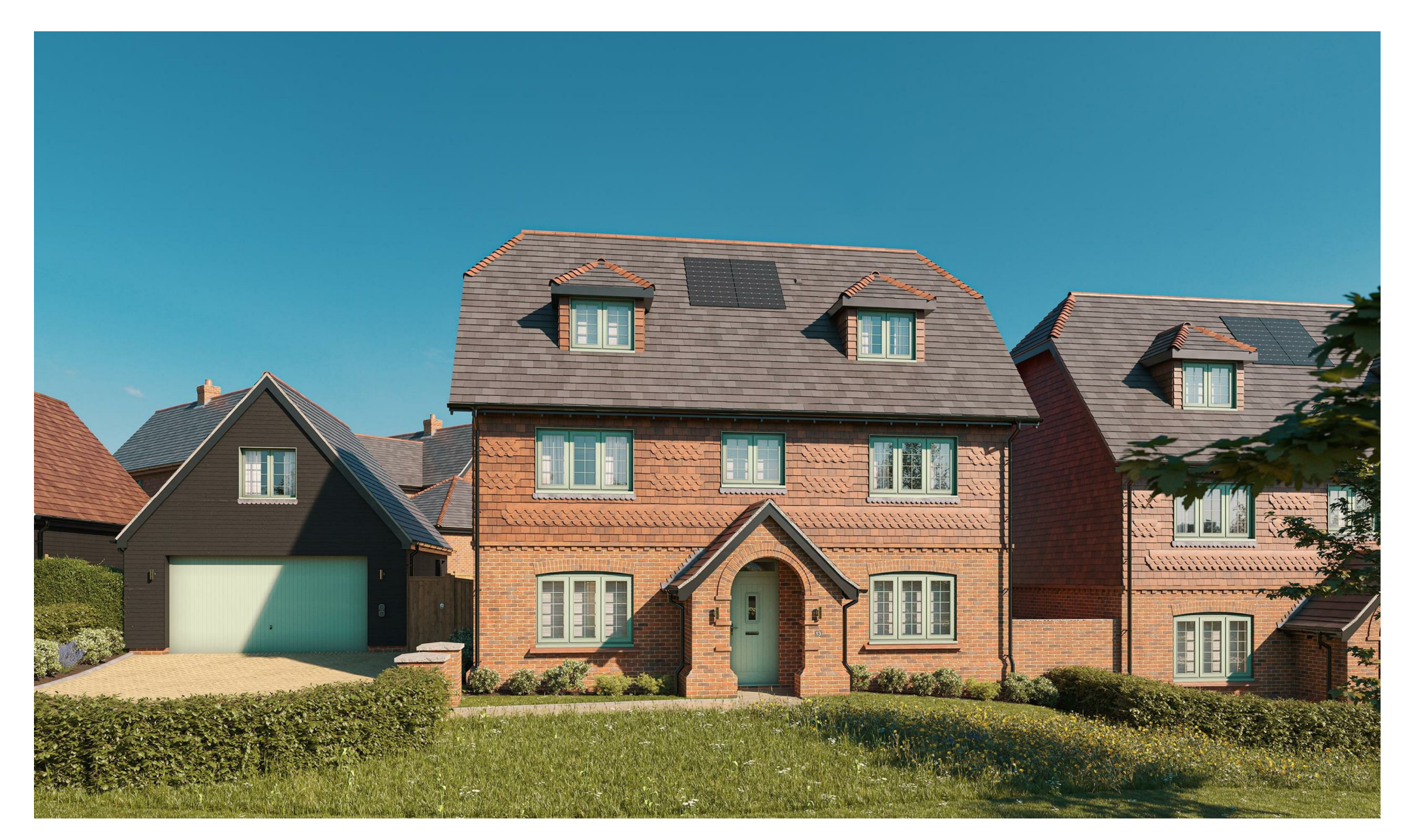
Firethorn Place, Ewhurst £949,950