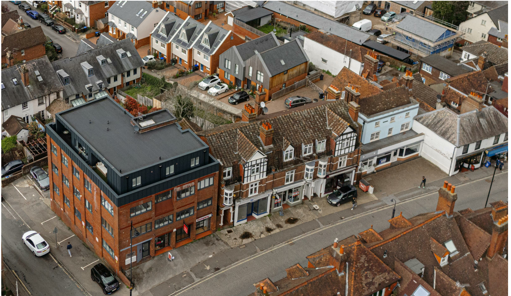
South Street, Dorking £290,000