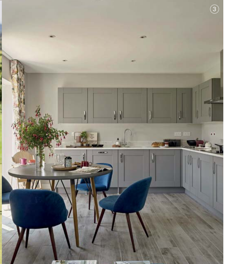
① ↳ Derby City Centre, Derbyshire ② ↳ Mickleover Golf Club, Mickleover ③ ↳ Typical Interior