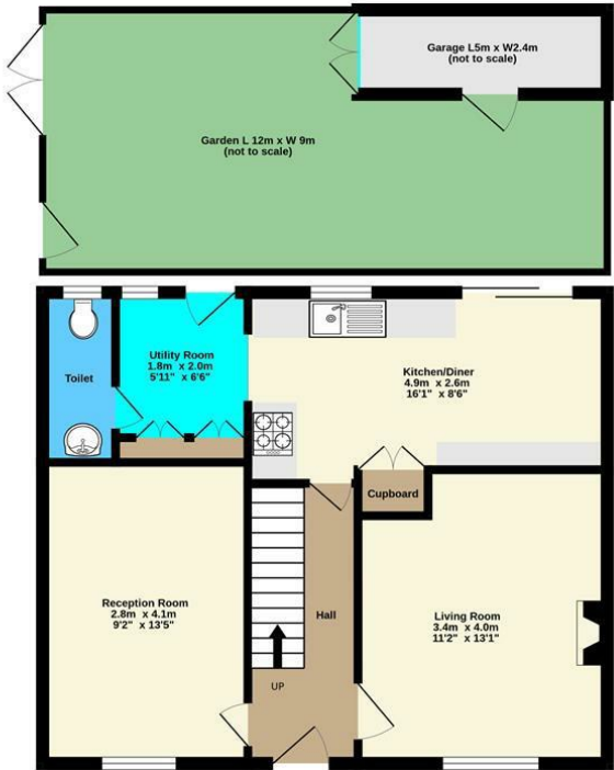
Ground Floor 49.3 sq.m. (531 sq.ft.) approx.

Agents Note: Whilst every care has been taken to prepare these particulars, they are for guidance purposes only. All measurements are approximate and are for general guidance purposes only and whilst every care has been taken to ensure their accuracy, they should not be relied upon and potential buyers/tenants are advised to recheck the measurements