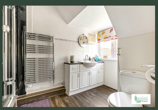
Mint Homes 14 Nicholas Gardens Pyrford Surrey GU22 8SD