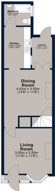
Ground Floor Approx. 43.2 sq. metres (464.5 sq. feet)