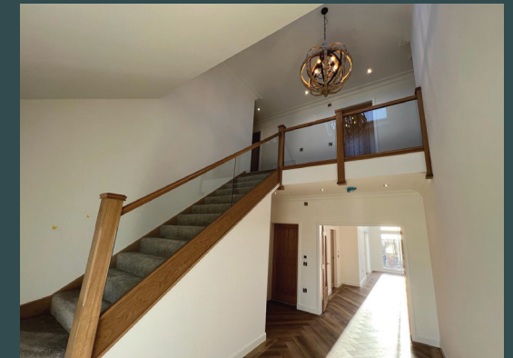
THE ABERLOUR- ENTRANCE HALL