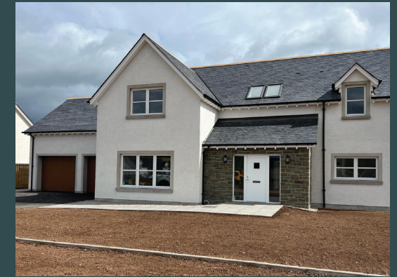
THE ABERLOUR- FRONT EXTERIOR