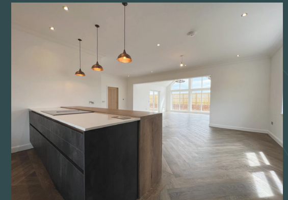
THE ABERLOUR- KITCHEN AND DINING AREA