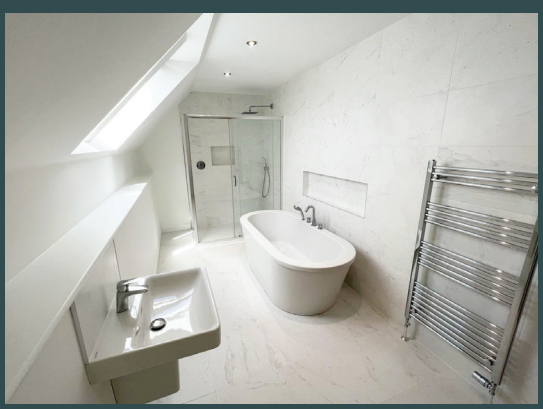
THE COLEBURN - BATHROON