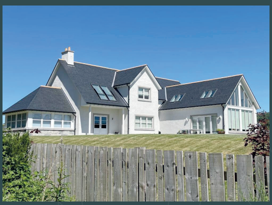
THE COLEBURN - REAR EXTERIOR

07976 896 494 info@snowdropdevelopments.co.uk