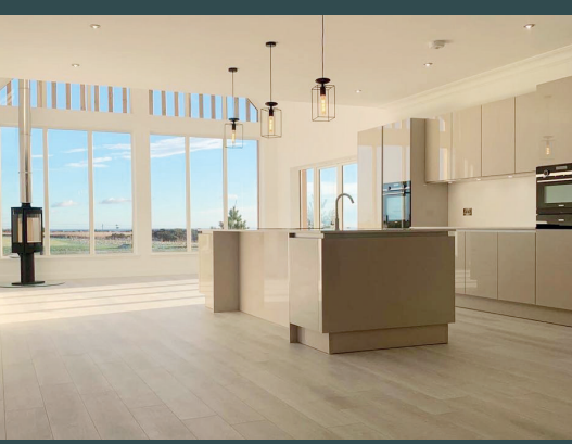
THE COLEBURN - KITCHEN WITH FAMILY ROOM