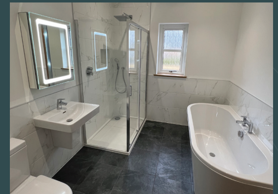
THE GLENISLA - BATHROOM