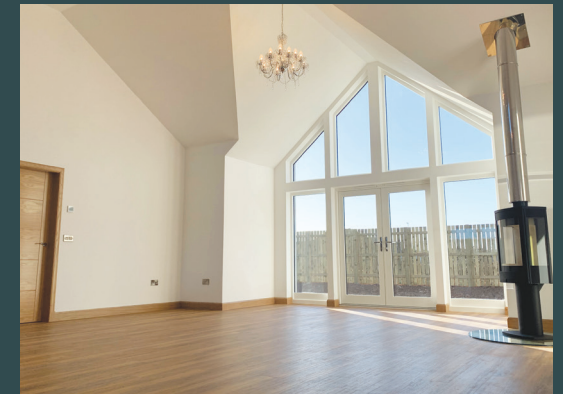
THE GLENISLA - LIVING AREA