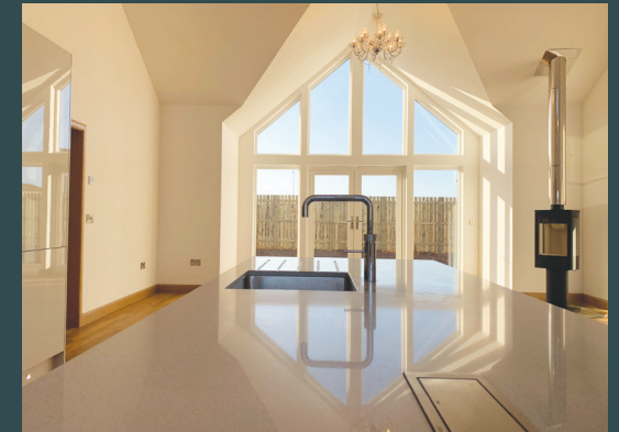
THE GLENISLA - KITCHEN