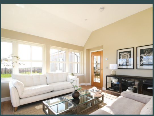
THE MACALLAN - OPTIONAL SUN LOUNGE