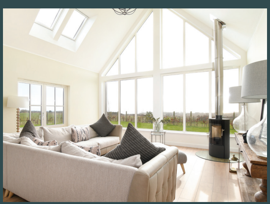
THE MACALLAN - FAMILY ROOM