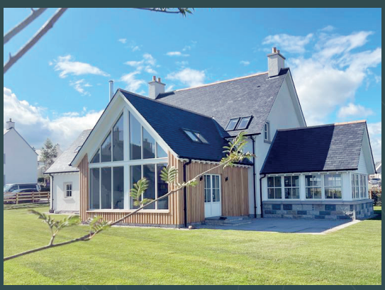
HE MACALLAN - REAR EXTERIOR

07976 896 494 info@snowdropdevelopments.co.uk