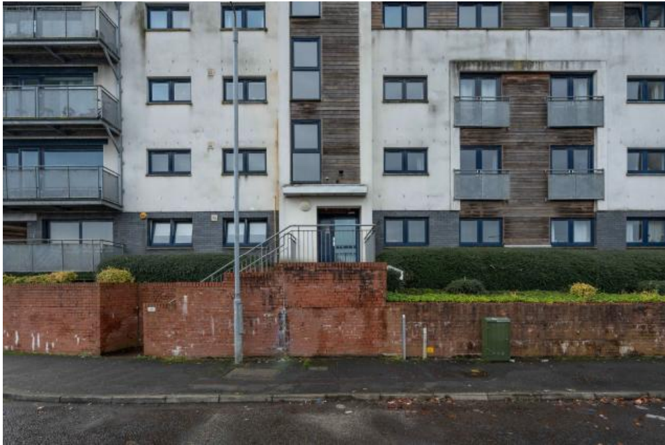
Flat 2, 261 Springburn Road Glasgow, G21 1SA

Approx Gross Internal Area: 668 Sq Ft (62 Sq M)