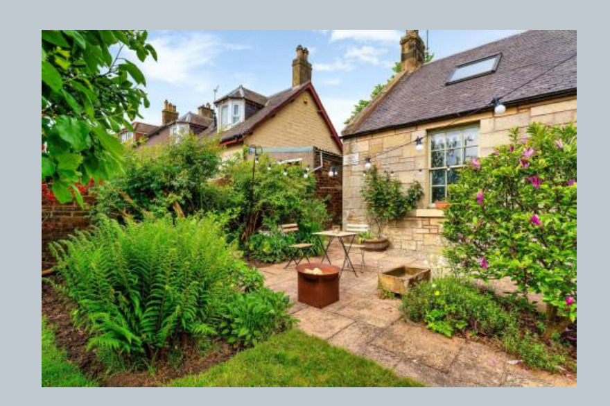
The property has gas central heating and double glazing throughout.