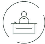
24 Hour Onsite Team