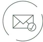
Electronic Mail Room