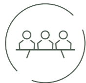
Executive Board Room