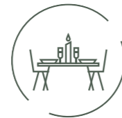
Private Dining Room & Kitchen