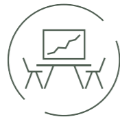
Personal Meeting Rooms