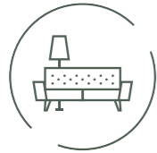
Hotel-style Lobby Lounge