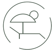
Penthouse Sky Lounge