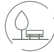
Ground Floor Gardens