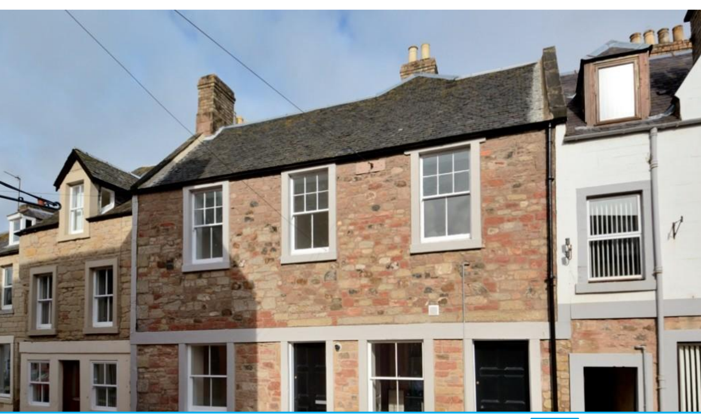
6, Golden Square, Duns, Berwickshire TD11 3AW