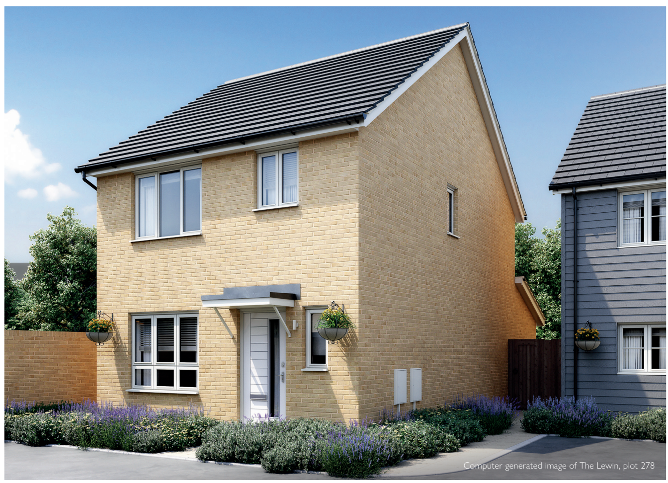
Computer generated image of The Lewin, plot 278