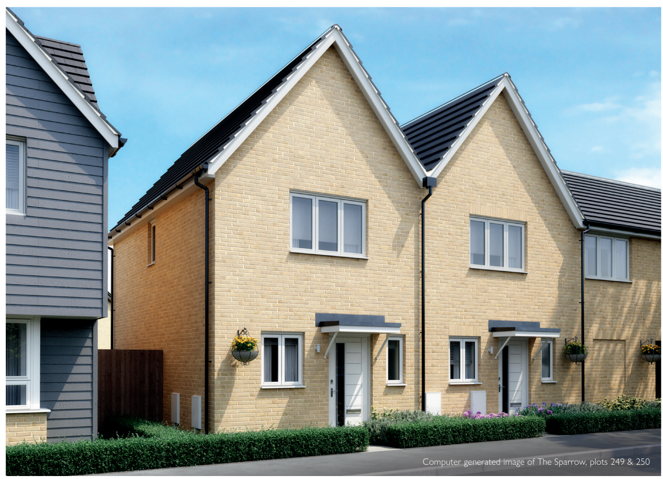
Computer generated image of The Sparrow, plots 249 & 250